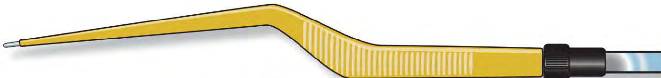
210-160 Pack of 10 Bayonet Bipolar Forceps 1.5mm polished tips 18cm