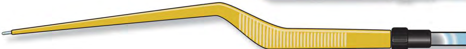
210-170 Pack of 10 Bayonet Bipolar Forceps, angled 1.5mm polished tips 20cm